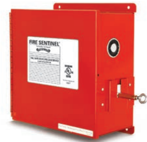
Fire Sentinel® time-delay release device